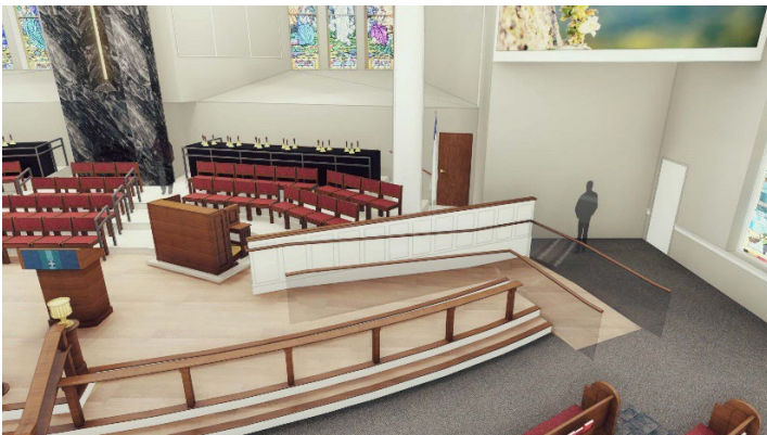
MATTHEWS UMC SANCTUARY RENOVATIONS | Matthews, NC Concept Design - August 2024