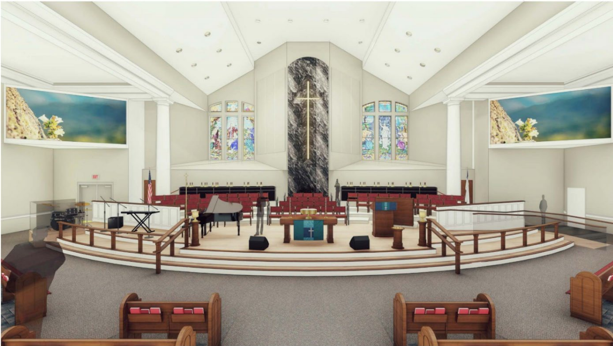
MATTHEWS UMC SANCTUARY RENOVATIONS | Matthews, NC Concept Design - August 2024

Many people asked about this during our Feasibility Study focus groups. After further review with the architects, the Building Committee decided that a ramp would actually be a better solution for the project. Everyone can use the ramp, regardless of their mobility and type of assistance (e.g., wheelchair, scooter, rollator, walker, cane). It also allows for multiple users, while the lift can only accommodate one person at a time. Once the ramp is installed, it should require no ongoing maintenance. A mechanical lift must be maintained and monitored for operability, which may incur additional costs. If the lift malfunctions, there would be no alternative accessibility to the Chancel area other than steps. Even though the ramp takes up more space, the Building Committee has determined that our Sanctuary will be able to accommodate it. Updated Renderings: