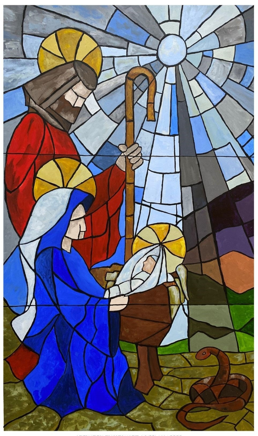
ARTWORK BY HOWARD NUSSMAN 2020