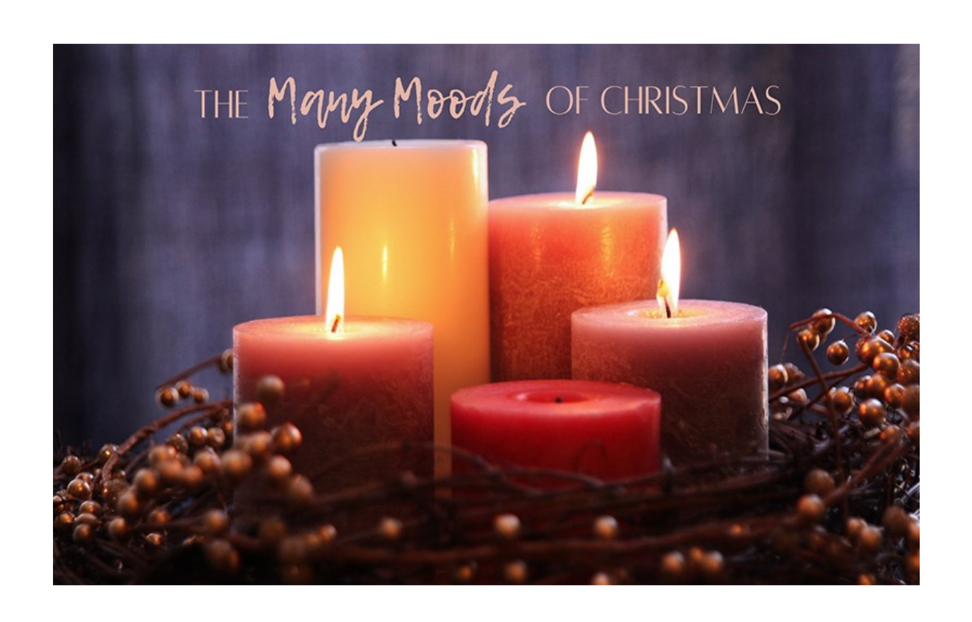
This Advent Study is based on the 2020 Advent Worship Series, "The Many Moods of Christmas."